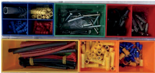
SKU: TCB-2RSTRBN-A (double row)